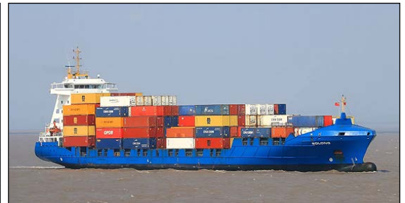
Figure 2: Solong