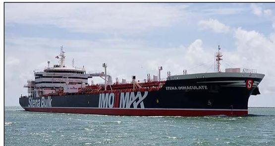
Figure 1: Stena Immaculate