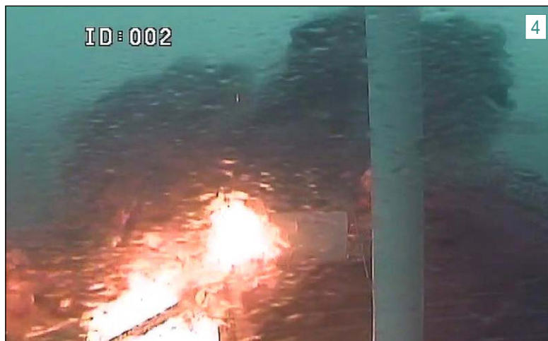
Figure 4: Initial collision