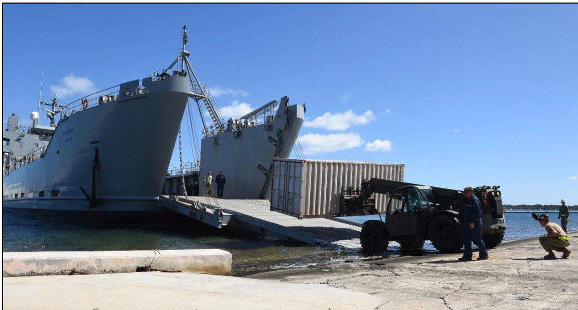
Figure 6. Besson-Class Logistics Support Vessel (LSV)